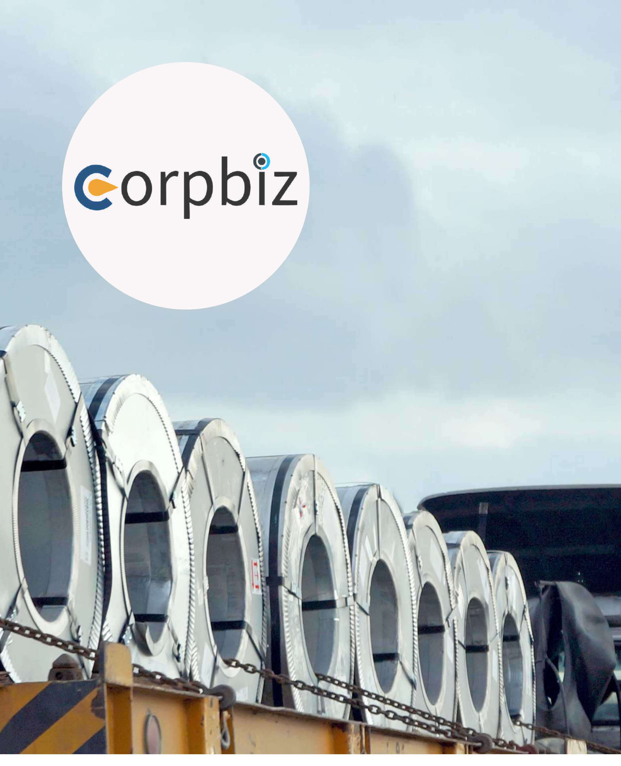
Extension of the Last Date for the Receipt of Applications under the Production Linked Incentive (PLI) Scheme