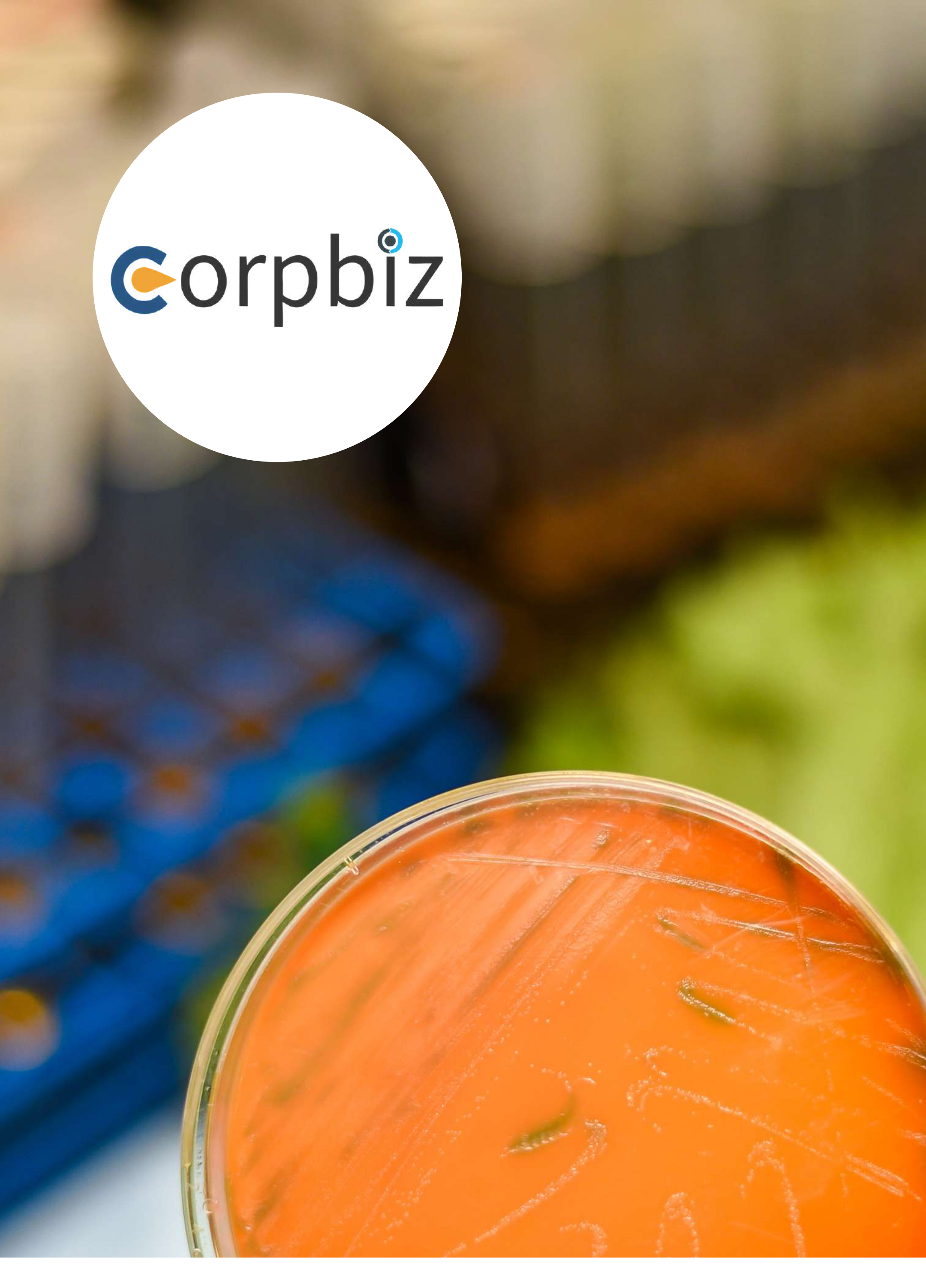
FSSAI plans to initiate E-inspection of food businesses